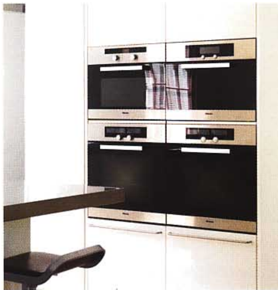
above Create a chic, monochrome scheme and a sense of symmetry with white gloss cabinetry and a bank of four all-singing-all-dancing ovens.