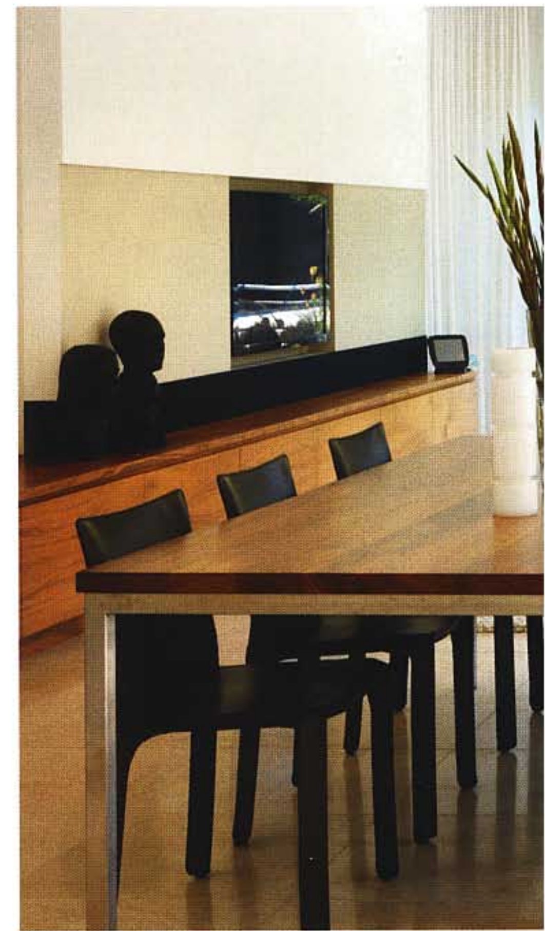
left & above Cooking, dining and entertaining are now effortless and pleasurable experiences thanks to the new free-flowing, light-filled room.