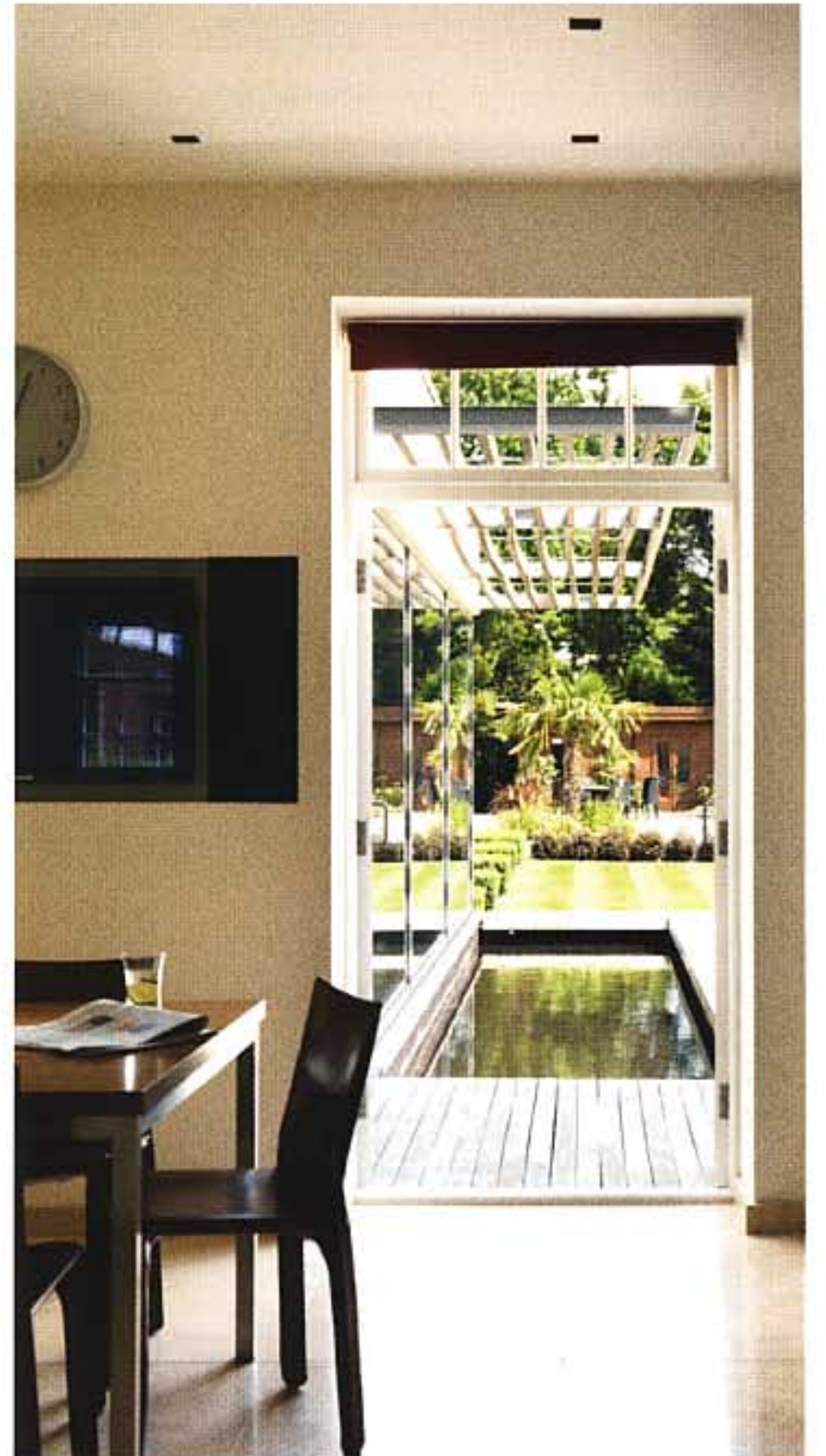
above Beautiful both inside and out, this impressive property includes a decked pool area that leads the eye to a manicured lawn and second patio beyond.