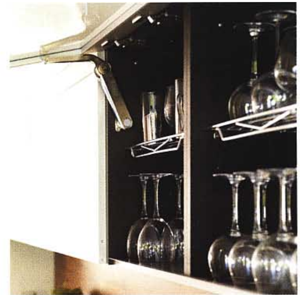
above Organisation is key for a smart, clutter-free cook zone so ensure there's a place for everything, including specific shelves for delicate glassware.